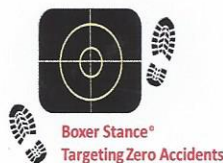
Director Pragmatix UK Limited

On completion of the course, all delegates were issued HSE pocket cards 'The safe Use of Ladders and Step Ladders'