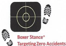
Director Pragmatix UK Ltd